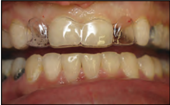
Figure 2. The prep guide/pontic positioning stent has been placed into position to assist in "spotting" the preps.