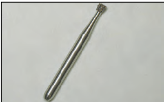
Figure 3. The Brasseler 38 inverted cone diamond provided with each case from DAL provides the ideal undercut prep for the DAL Monodont Bridge.