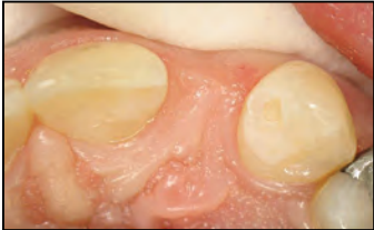
Figure 4. The positioning stent has been removed and the preps have been finished from the proximal to create the adequate undercut prep for the retentive wings.