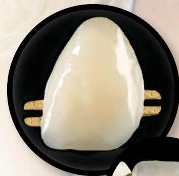
DAL Monodont Bridge with Layered Composite Layered Composite Pontic for Ideal Anterior Esthetics