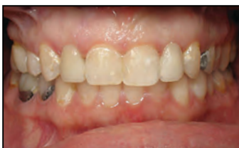
Figure 6. Finished DAL Monodont Bridges bonded in place replacing teeth #7 and #10.