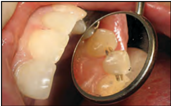
Figure 5. Try-in of the DAL Monodont Bridge prior to bonding to place.