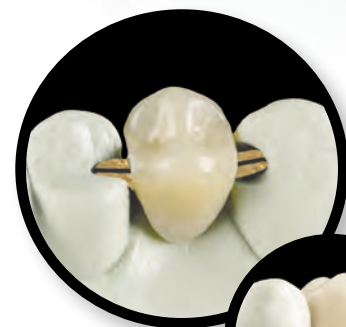
DAL Monodont Bridge with Acrylic Acrylic Pontic for Cost Efficiency and Durability