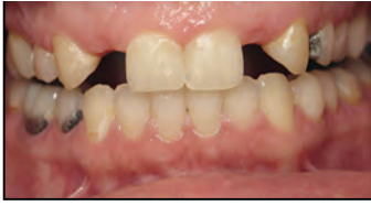
Figure 1. Patient presents with two congenitally missing laterals.